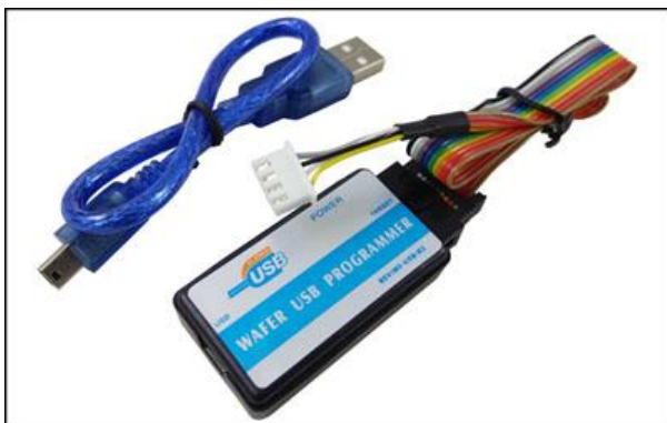
USB program adapter box

The bellow wire picture is to show how to connect the cable to the PC program connector with the Program adapter.Please connect it in the right direction with the picture.